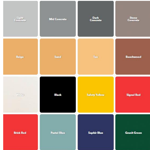
Standard Color Chart – Pre-Tint and LABTEC Universal Pods